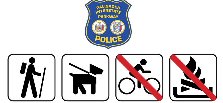
Tips for Palisades Hikers

In case of emergency, call the Parkway Police before calling 9-1-1: 201-768-6001