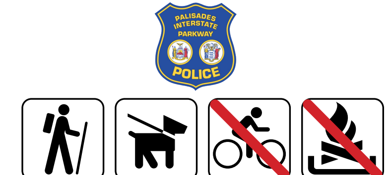
Tips for Palisades Hikers

In case of emergency, call the Parkway Police before calling 9-1-1: 201-768-6001