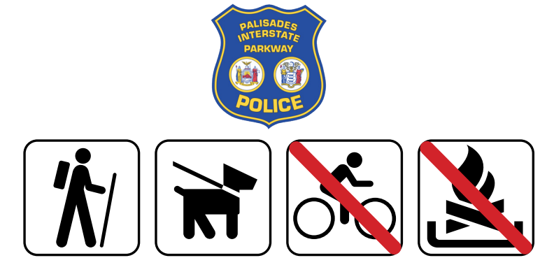
Tips for Palisades Hikers

In case of emergency, call the Parkway Police before calling 9-1-1: 201-768-6001