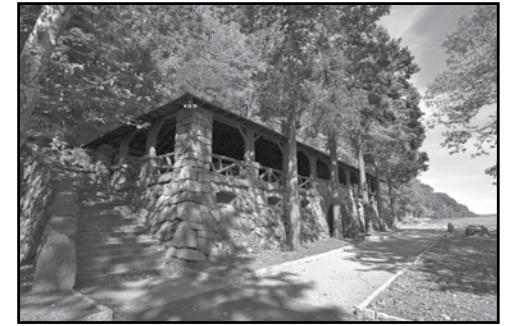
ALPINE PAVILION Capacity: 125