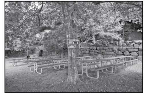
ALPINE GROVE Capacity: 125