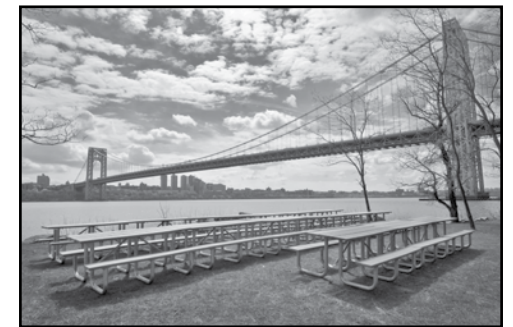
CARPENTER'S GROVE Capacity: 90